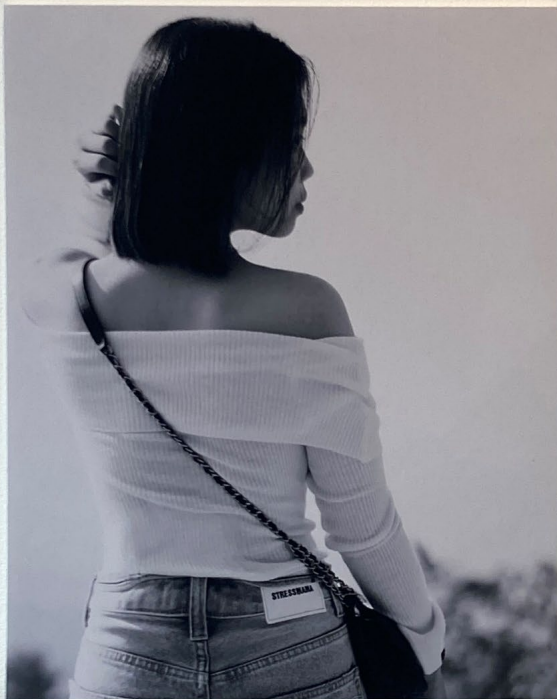
Vy CATS Cambridge 16-19 Category