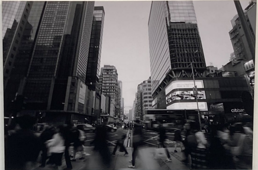
Peter CATS Cambridge 16-19 Category

For one of my images that I submitted to the NUA Beyond a Frame competition, I took it in Hong Kong, which has a constant flow of people and vehicles and they all complement the rhythm of the city. For my image with the crowded streets, I stood in the crowd and watched people pass by like the time. When I was shooting, I saw how busy Hong Kong was, so I recorded this photo in the form of using a slow shutter speed to capture the movement.